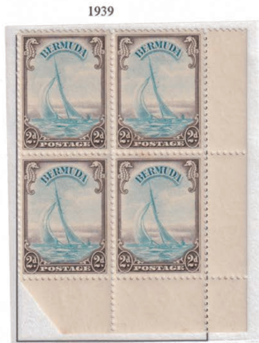
Centre: light blue Frame: sepia