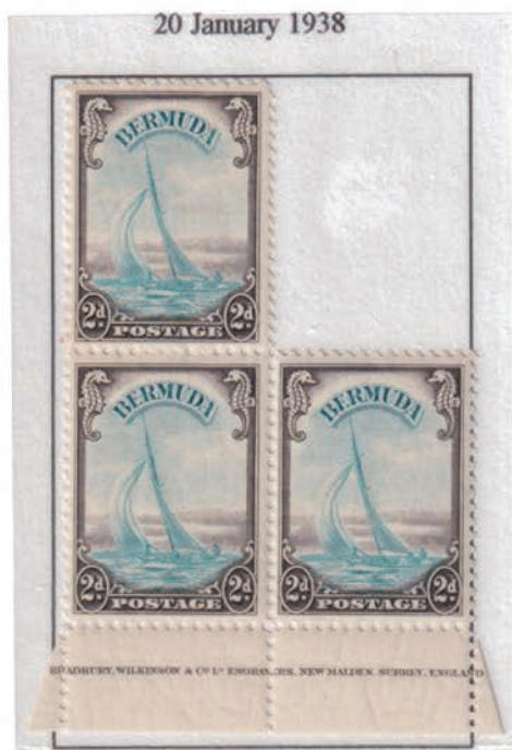
Centre: light blue Frame: blackish sepia