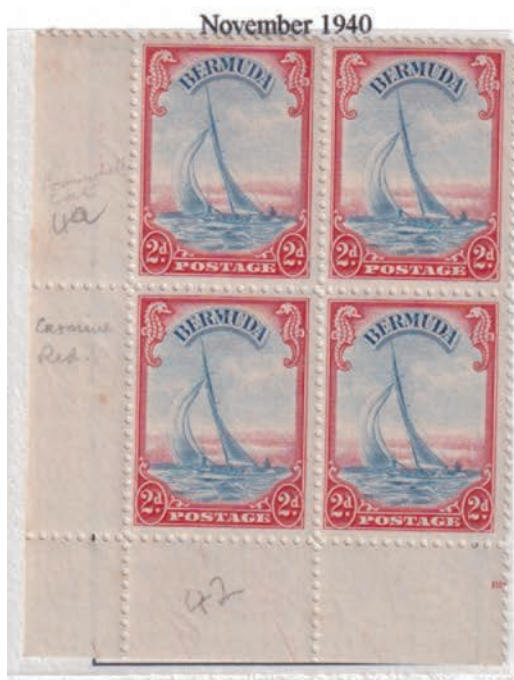
Centre: ultramarine Frame: carmine-red