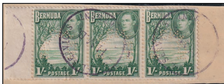
1938 colours cancelled H.M.B. - Home Mail Branch.