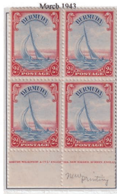
Centre: light blue Frame: dull carmine-red