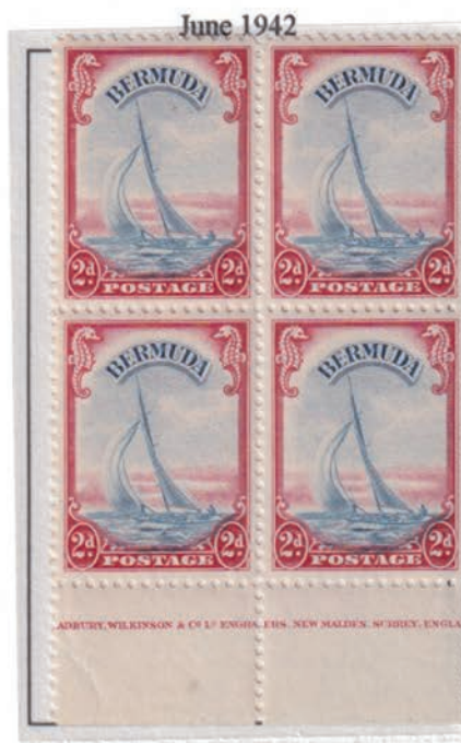
Centre: ultramarine (lighter) Frame: deep carmine-red