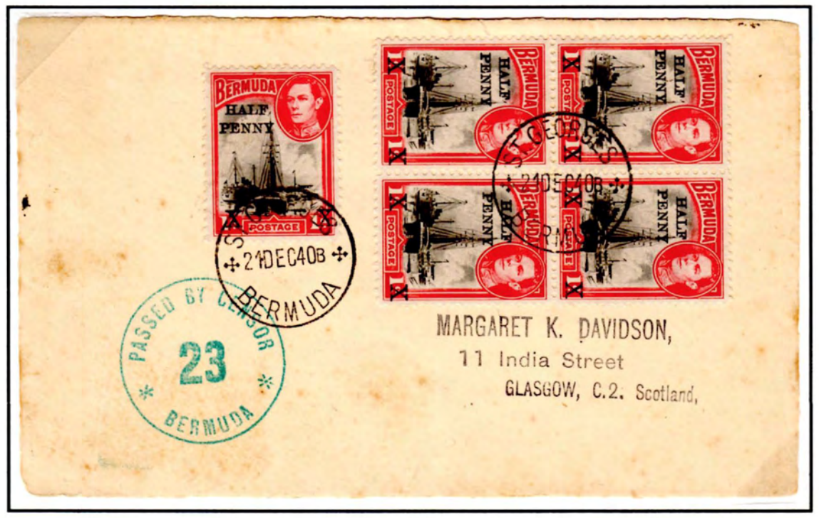
21 December 1940 St. Georges Post Office to Glasgow, Scotland. Censored.