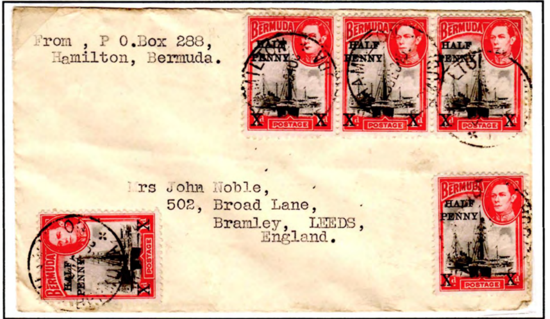
23 December 1940 Hamilton Post Office to Bramley, Leeds, England.