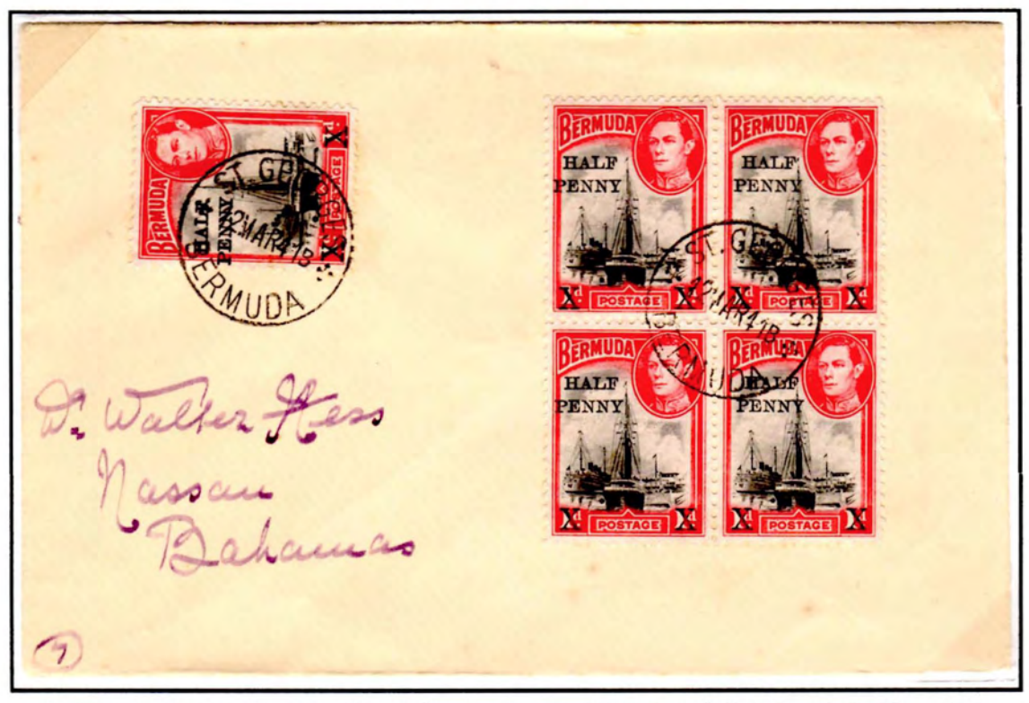
12 March 1941 St. Georges Post Office to Nassau, Bahamas. "P" shift on left side pair in block of four.