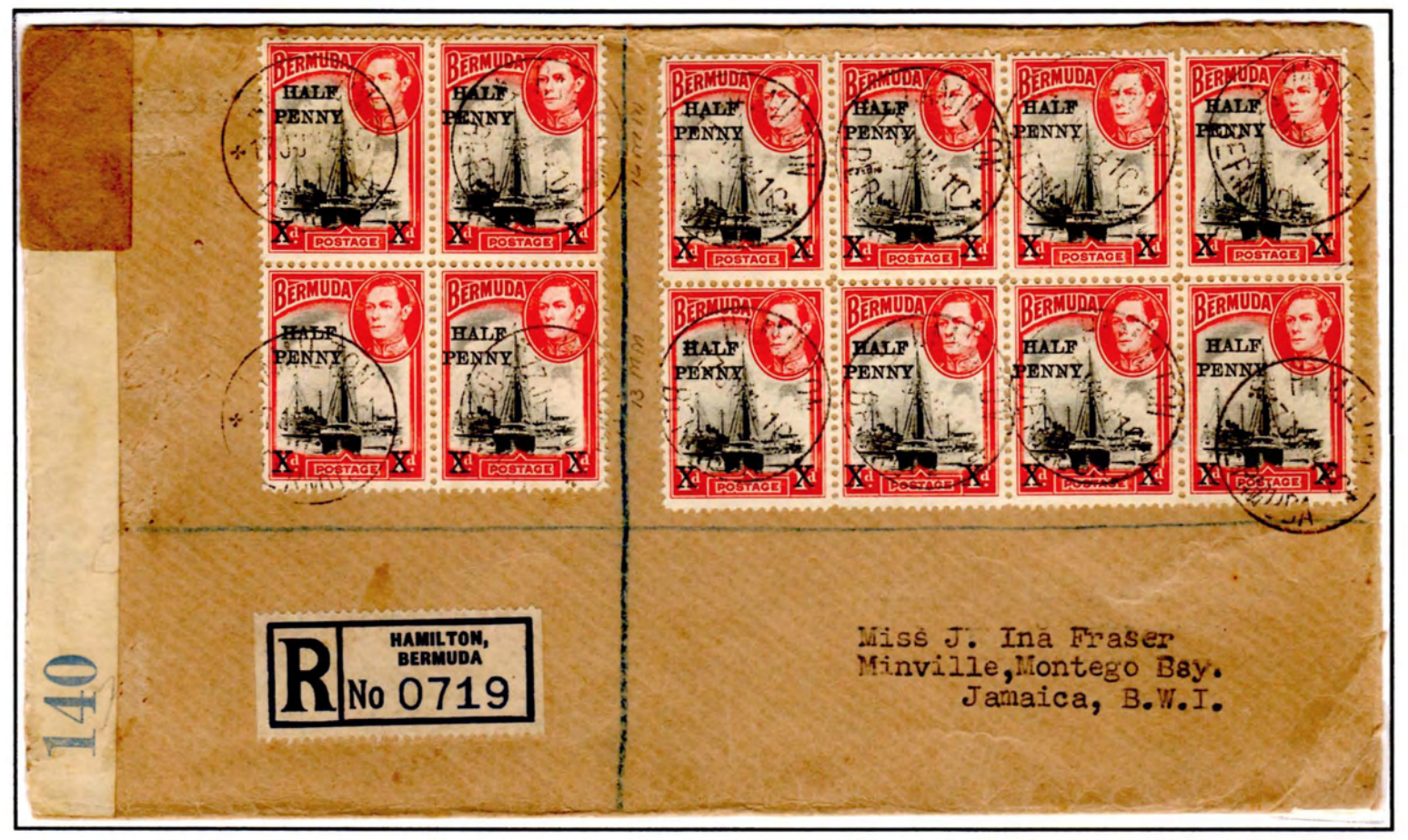
7 June 1941 Hamilton Post Office to Montego Bay, Jamaica. Backstamped 28 June 1941 Kingston and Montego Bay. Rate: 2<sup>1</sup>/<sub>2</sub>d. + 3d. Registry fee = 5<sup>1</sup>/<sub>2</sub>d. 6d. Paid. Overpaid <sup>1</sup>/<sub>2</sub>d. Censor number 140 used November 1940 to November 1941.