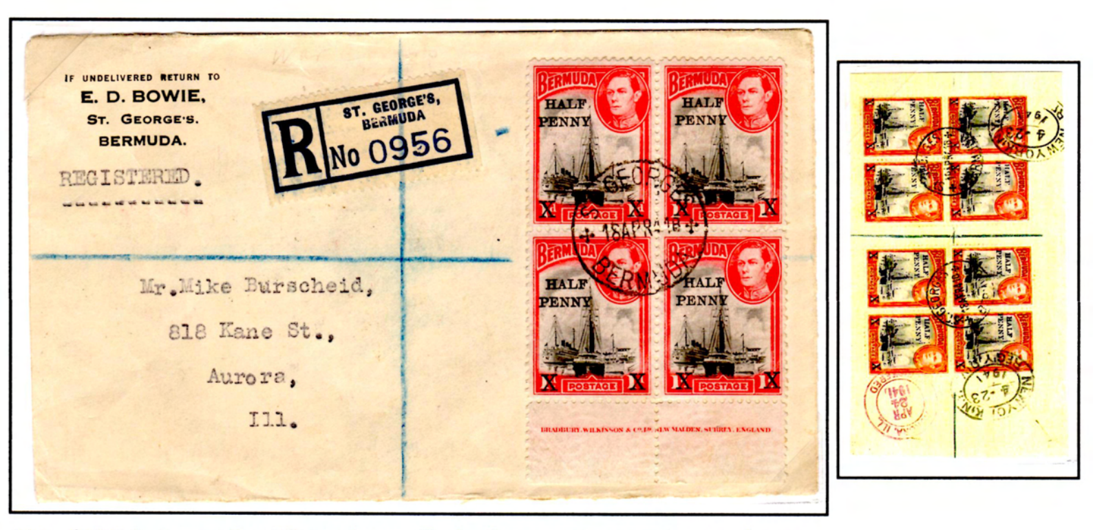
18 April 1941 St. Georges Post Office to Aurora, Illinois. Six pence postage and registry fee required twelve half-penny stamps which took both sides of the envelope.